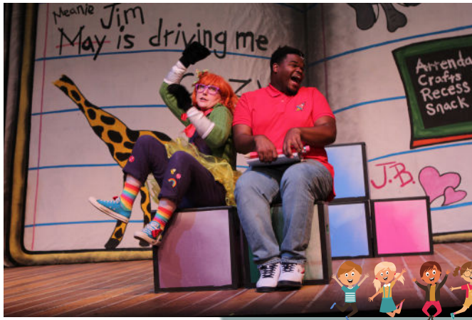
Charleston Stage working with Cainhoy Elementary School