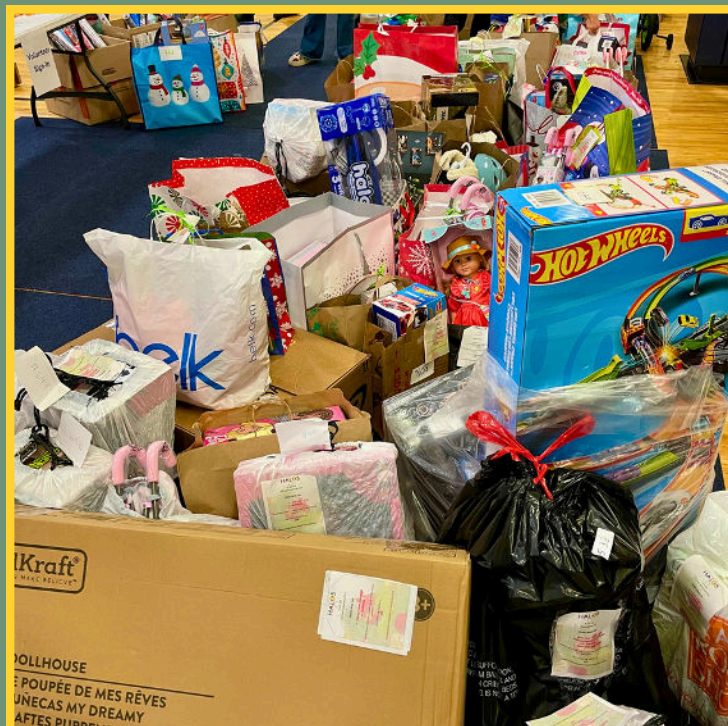
The Foundations HALOS Annual Gift Drive provided holiday gifts for 200 children!

The Daniel Island Community Foundation fundraises and helps support: