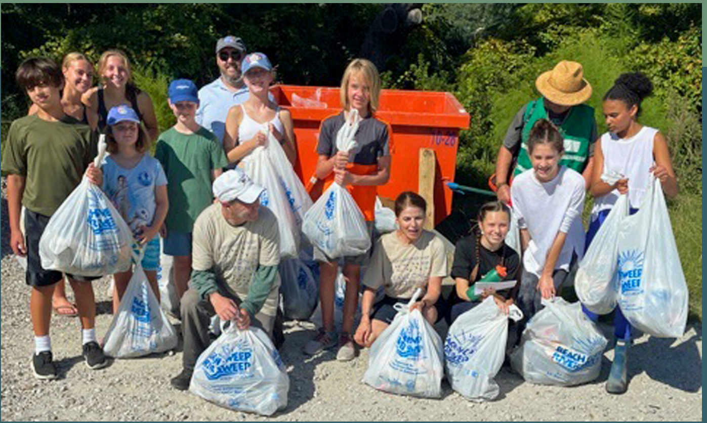
Locals working hard at the Annual Beach Sweep River Sweep at Waterfront Park^