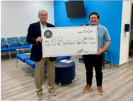
East Cooper Community Outreach