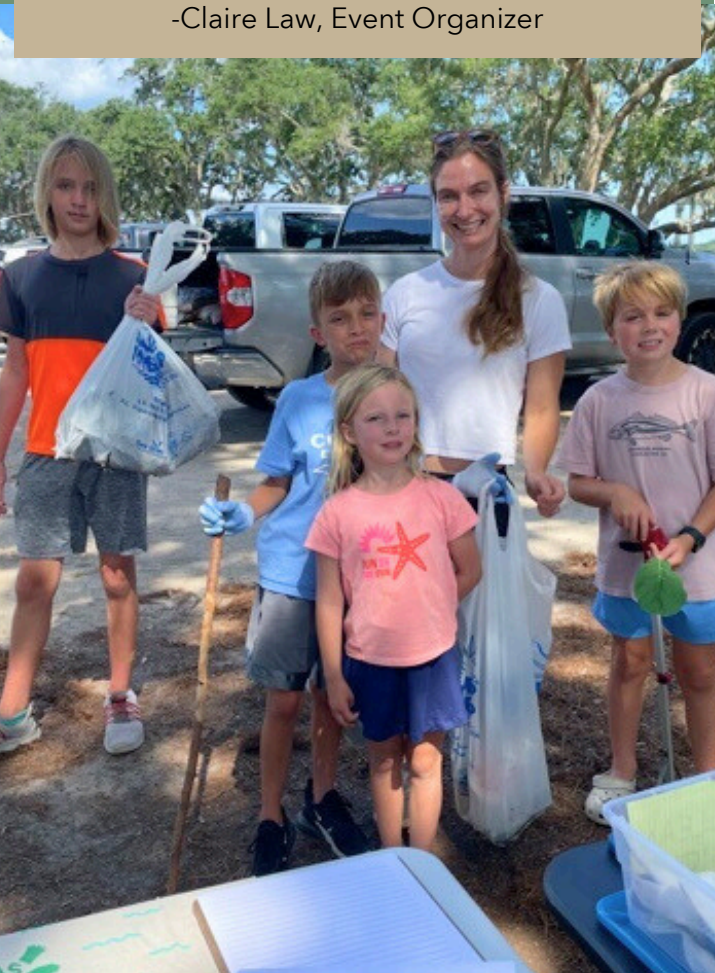
Volunteers at the Annual Waterfront Park Beach Sweep River Sweep