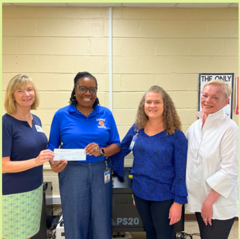
Random Acts of Kindness working with the Cainhoy Schools

-The American Red Cross Lowcountry Chapter