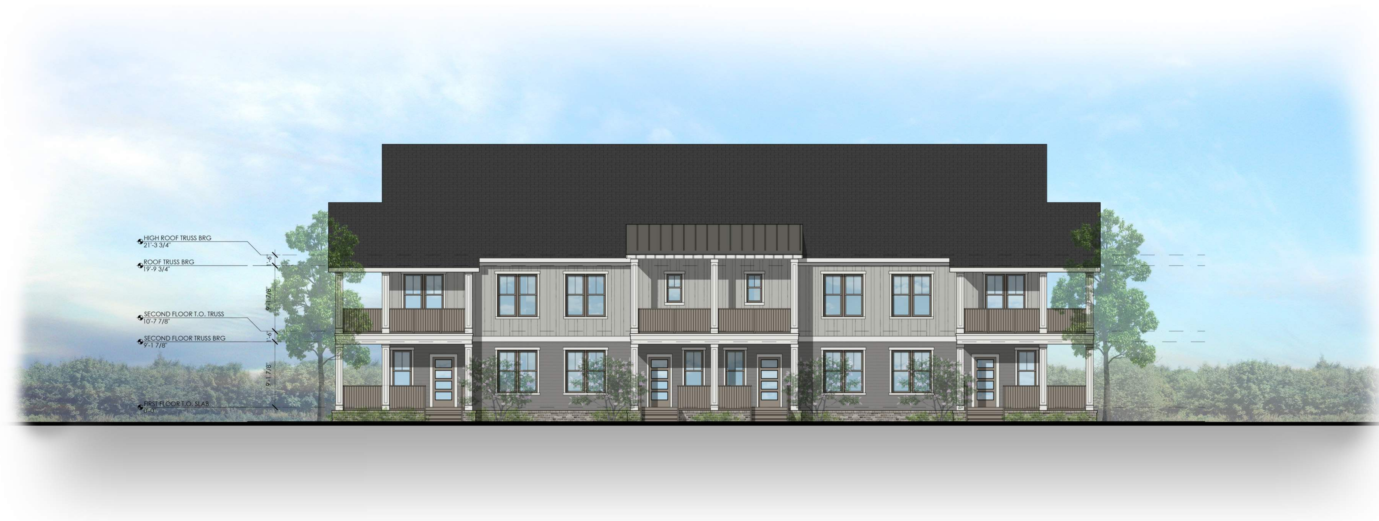
① BLDG 4 TOWNHOME - REAR ELEVATION SCALE: 1/8" = 1'-0"