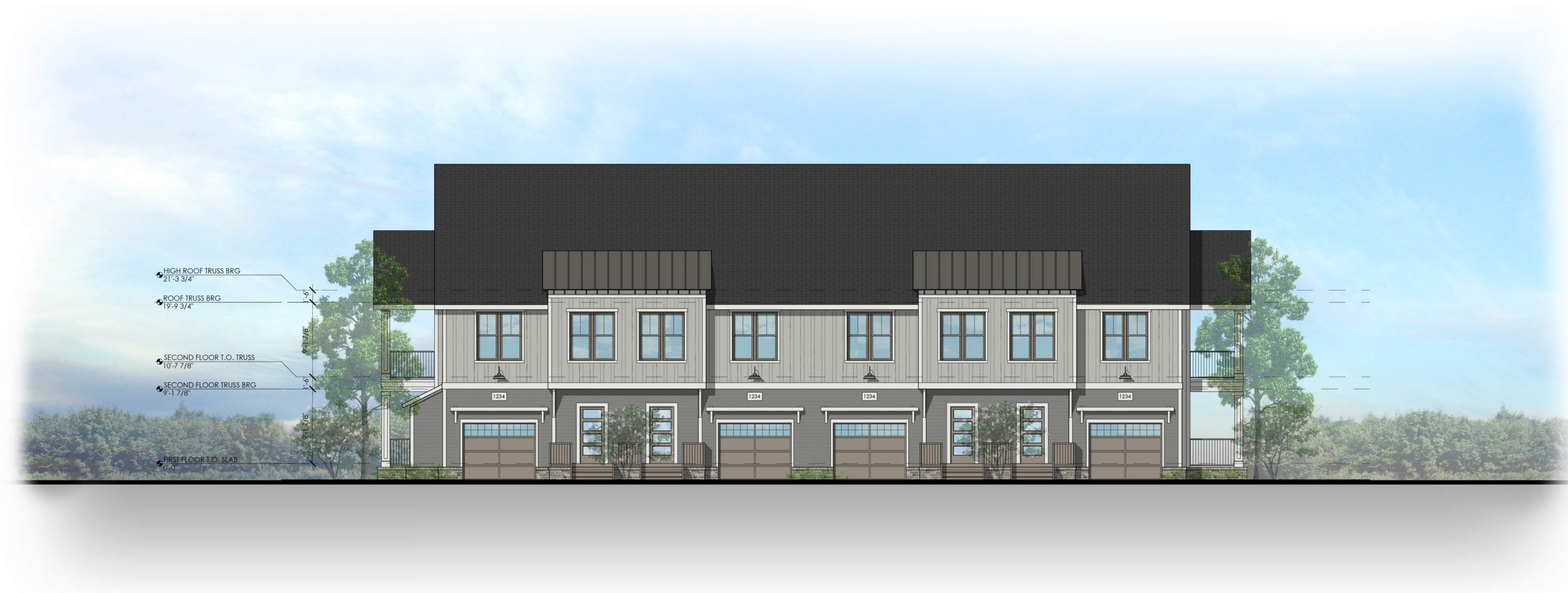
① BLDG 4 TOWNHOME - FRONT ELEVATION SCALE: 1/8" = 1'-0"