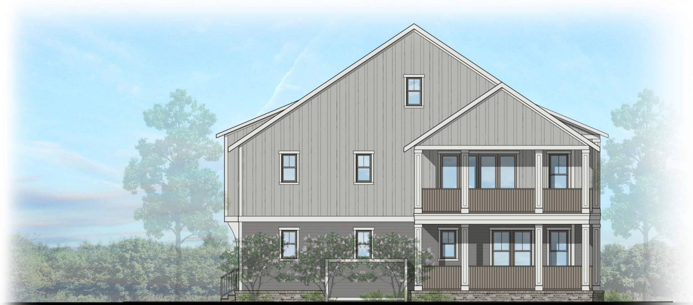
① BLDG 4 TOWNHOME - SIDE ELEVATIONS SCALE: 1/8" = 1'-0"