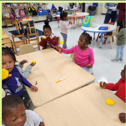
The first STEM Lesson at Cainhoy Elementary School in 2023.

"The Daniel Island Community Fund continued the unique legacy of Jazz in Charleston by providing Scholarship Funding for Charleston Jazz Academy students to experience the personal expansion of music education regardless of financial need."