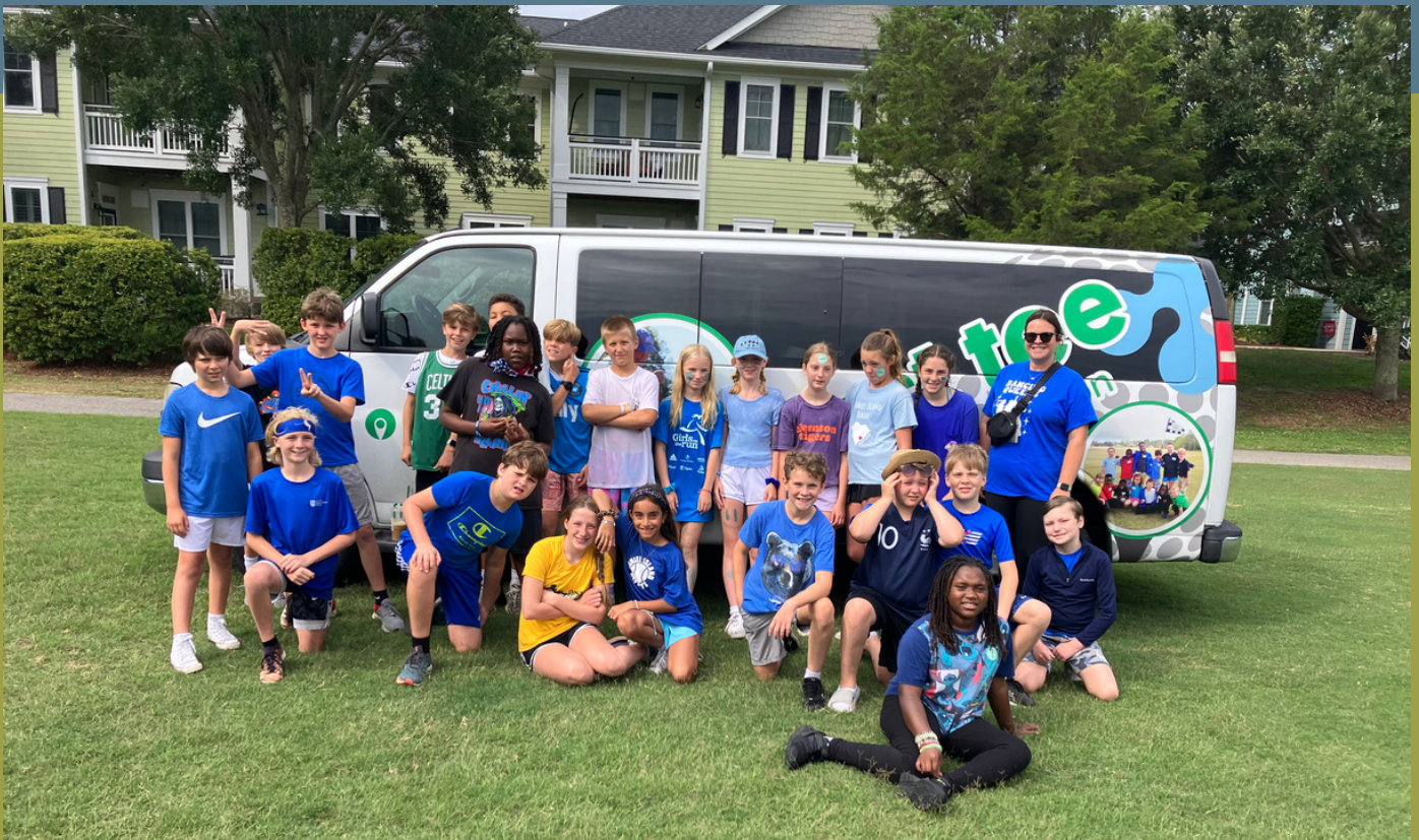
First Tee - Greater Charleston at Daniel Island School^