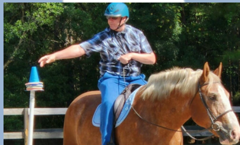
Blissful Dreams Rescue Ranch