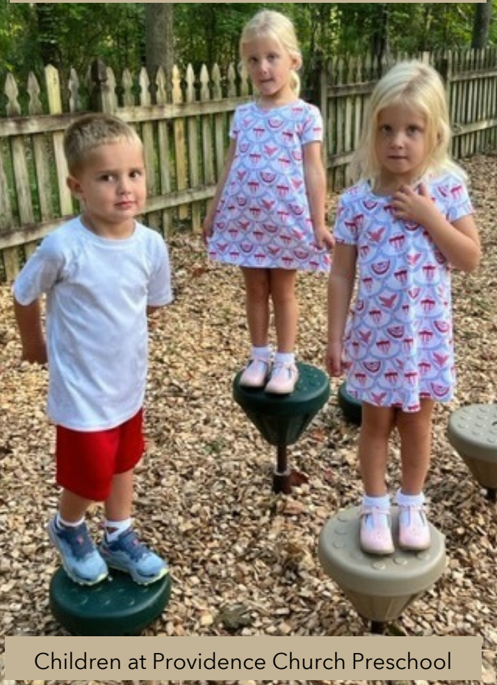
Children at Providence Church Preschool