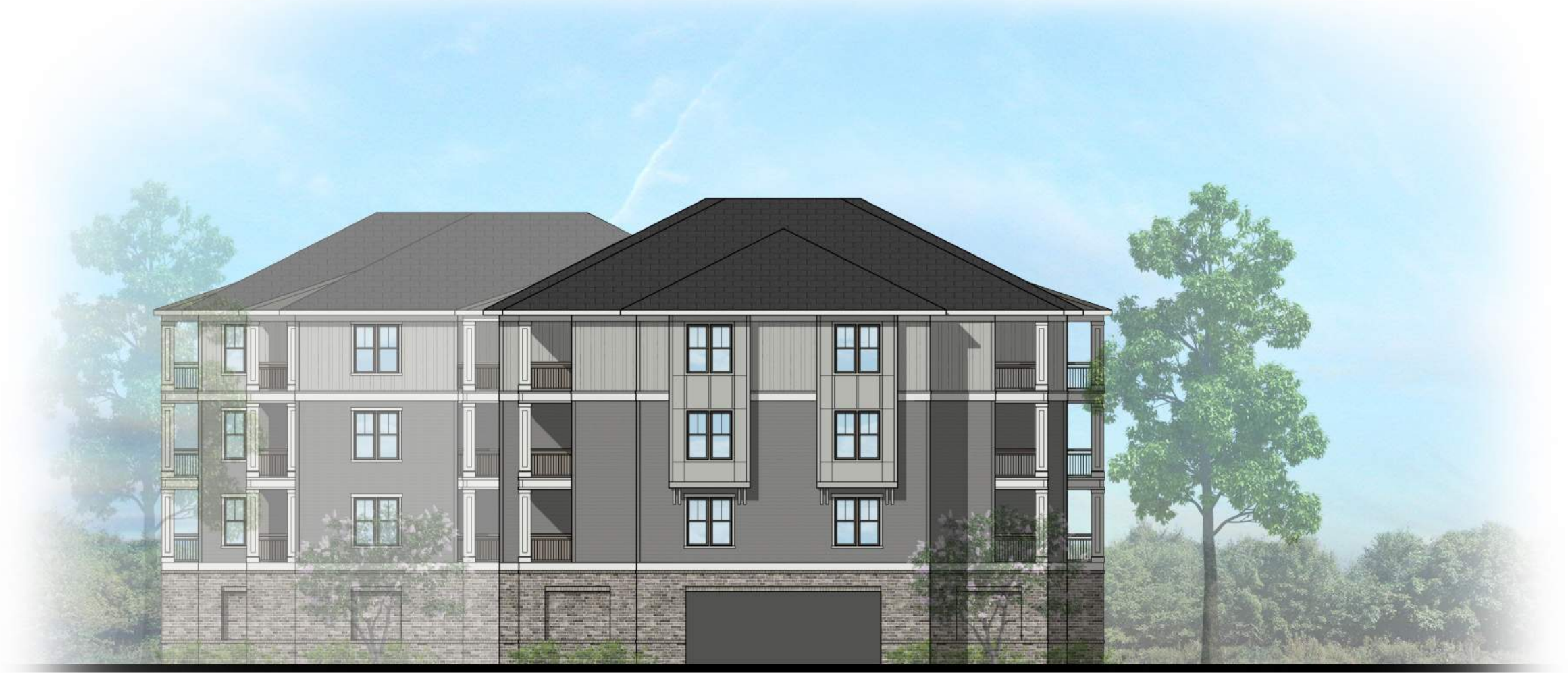
② BUILDING 1 WEST ELEVATION SCALE: 1/16" = 1'-0"