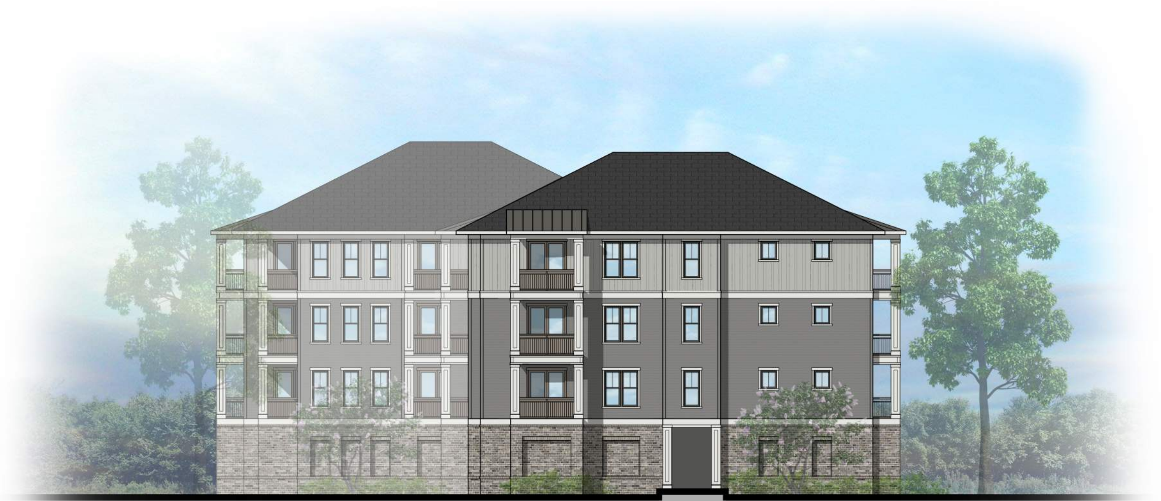
① BUILDING 1 EAST ELEVATION SCALE: 1/16" = 1'-0"