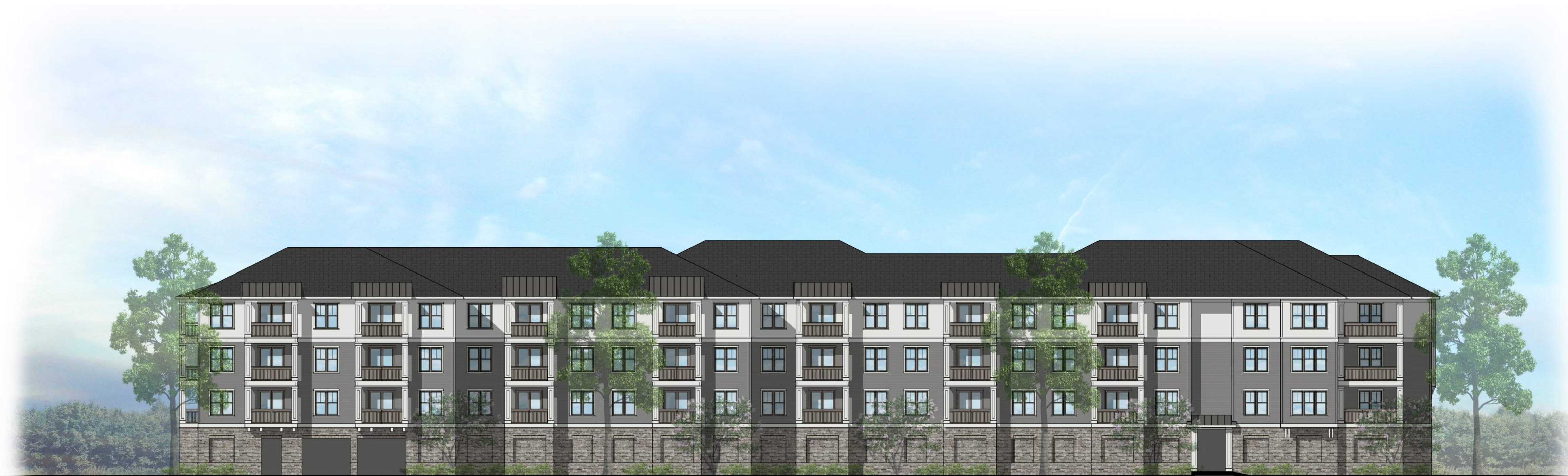
① BUILDING 1 NORTH ELEVATION SCALE: 1/16" = 1'-0"