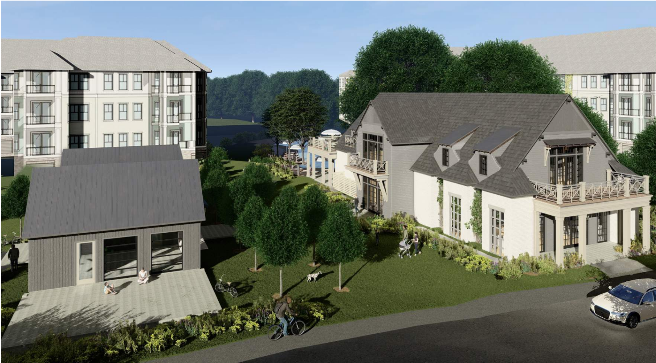
Daniel Island III