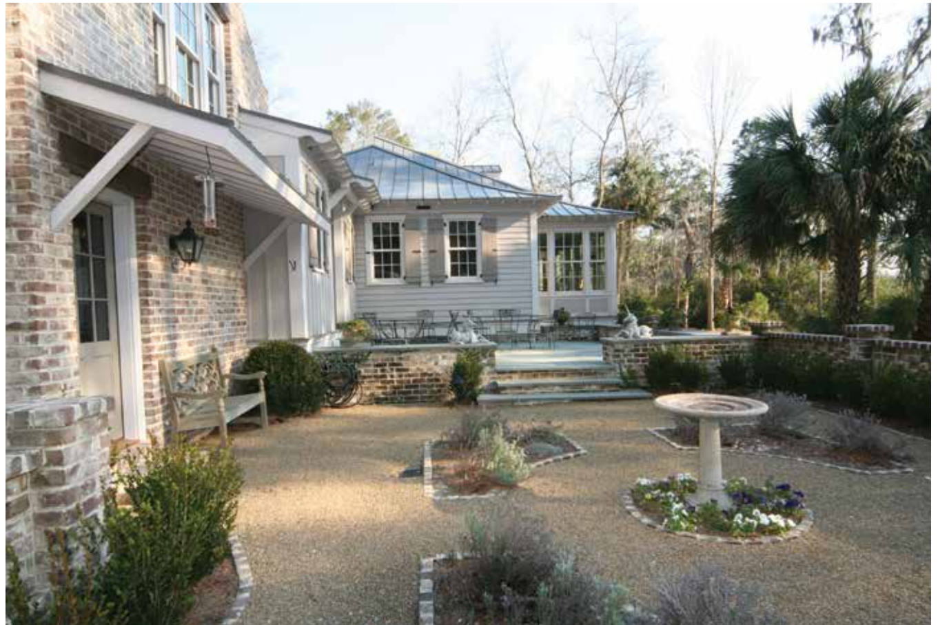
Walls and hedges define an upper terrace and lower garden.