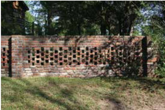
A pierced or “pigeon-holed” brick wall creates a visually porous screening solution. It can also serve as a complement to brick used in the foundation and chimney of the home.