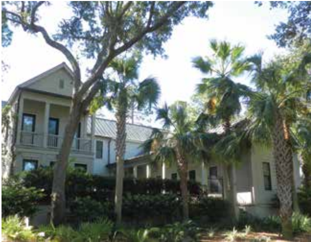
A combination of hedges and walls helps create a private yard in this instance. The landscape provides a graduated step up to the elevation of the home.

Good fences and walls are critical to the friendly ambiance of a community. They must be constructed of high quality materials and provide the framework for creating positive outdoor spaces. Locations for walls and fences should respond to the desire for privacy and protection from not only passing vehicles and pedestrians but also from winter breezes. They should take into account views from the outdoor room, courtyard, or garden. Brick pigeon-holed walls or simple picket fences are preferred solutions. There are almost limitless variations that can be made to the top of a simple picket to give it