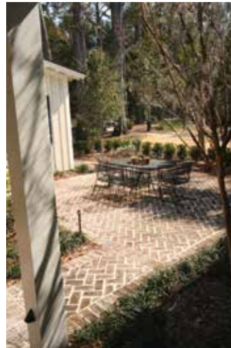
Here a terrace connects two walks.