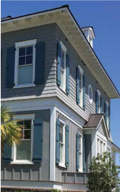
Roof Eave depth and design should reflect the aesthetic of the home. Open rafter tails lend themselves to the relaxed Lowcountry setting. Rafter tails can be squared or shaped.

Roof eaves should project 18 to 24 inches, however, instances that are greater than 24 inches may be considered in the case of an exceptional design. Roof eaves of less than 18" will be considered on a case-by-case basis for special situations that require less overhang. Eave overhangs on dormer windows and bay windows may be proportionately less.