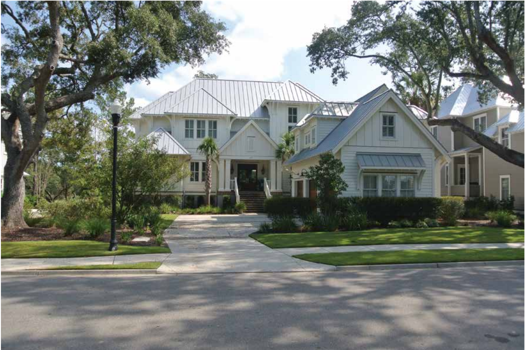
Captain's Island zoning allows a garage building to be in front of the home and the main body of the home sited further back toward the view.