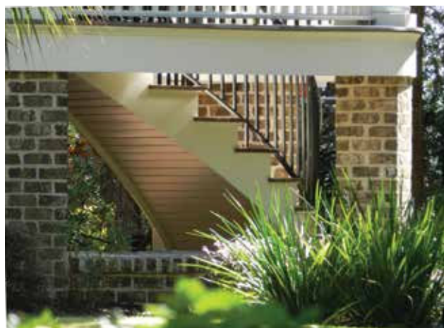
These stairs are beautifully incorporated into the primary volume of the home. Note the detailing on the underside of the staircase.