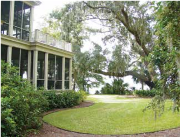
This home is sited to maximize its water view and solar orientation. Note how the rear porch steps down in concert with the site-defining oak tree.

In addition to property line and setback requirements, there are many influencing conditions that should inform the location of a Captain's Island home. Homes should respond to unique lot configurations, neighbors, solar orientation, vistas, water, existing trees, and other important criteria. The result of this sensitive approach is an appropriate and dynamic - and often asymmetrical - site placement.