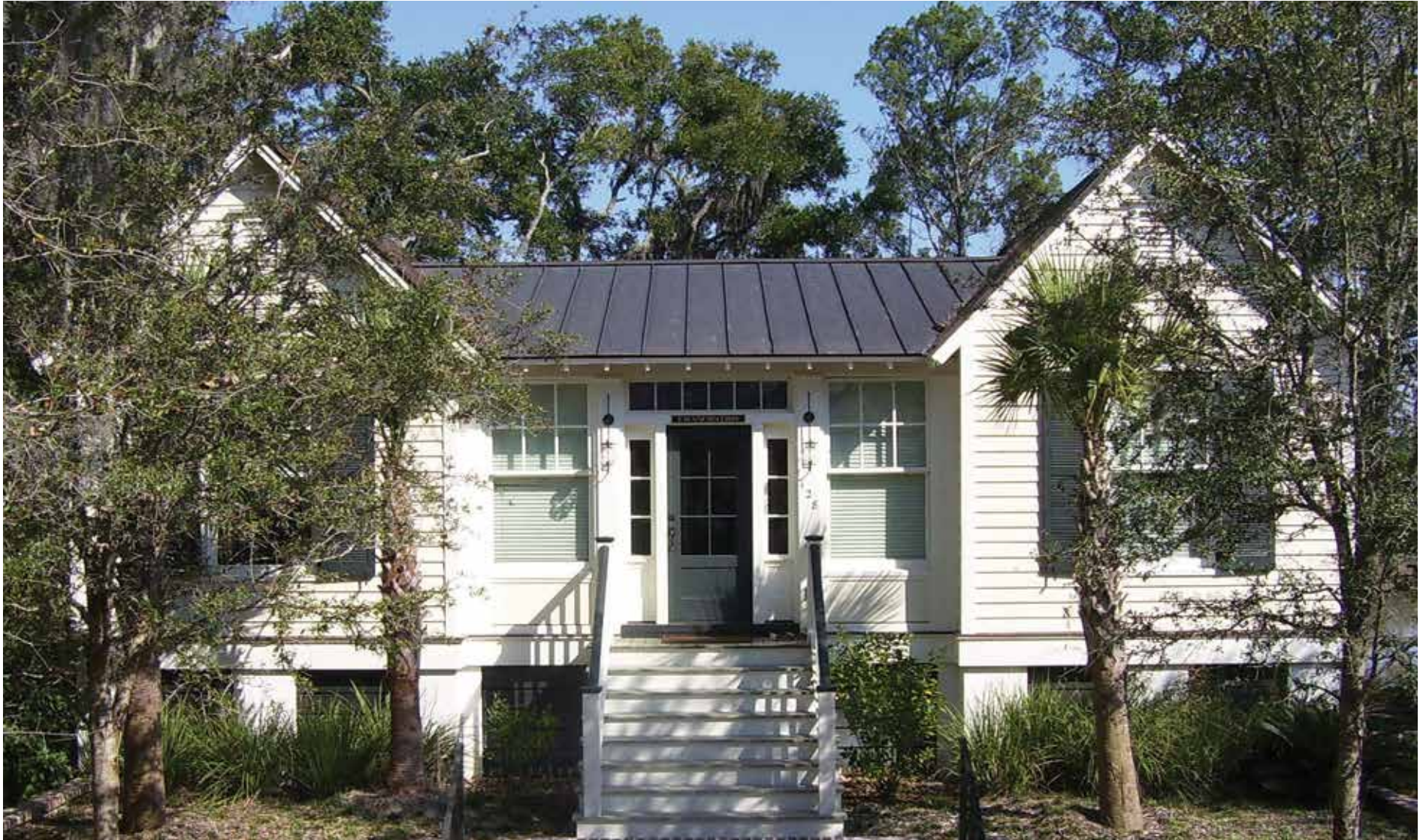
Secondary roofs are not always at the edges and can connect between two primary roofs. This roof combination harkens back to a simpler island architecture where two structures (or cabins) would have been connectd together over time.