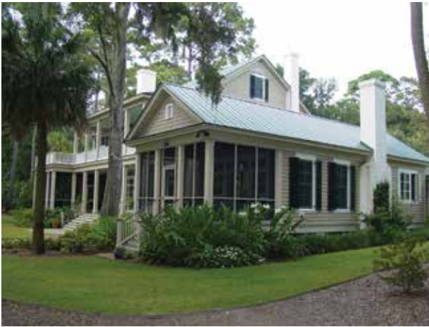
In keeping with the vision for Captain's Island, homes are respectfully blended into the island's natural beauty, lawn areas are minimized and foundation plantings layered.

The unique nature of exemplary waterfront communities such as Rockville on Wadmalaw Island, Sullivan's Island, and the Old Village of Mount Pleasant is based on a thoughtful diversity of expression and siting. Captain's Island features a variety of homesite types, views and sizes, providing the opportunity for a rich and eclectic rhythm to the streetscape. Buildings here are intended to be subordinate to nature and the landscape. The existing natural environment should be protected and enhanced, and the approach of development should be in response to the existing conditions as much as possible. Site development, grading and drainage improvements should focus on minimizing impacts to the site, protecting water quality, and the continued use of natural drainage systems. The retention of existing trees is critically important.