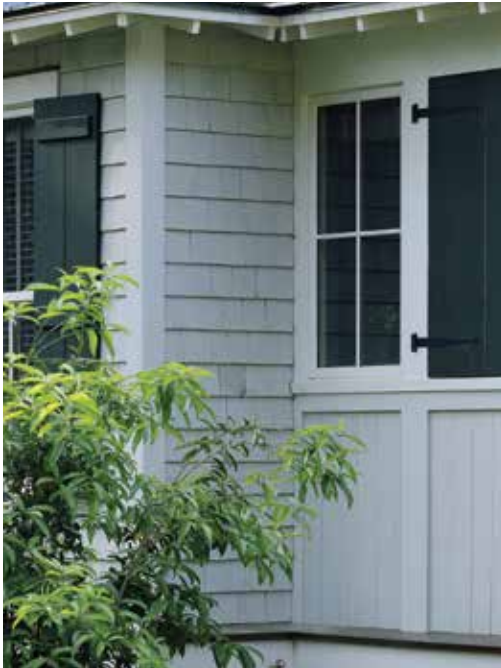
Wall material (and color) changes should occur at inside corners in most cases. Corner boards are common when using lap or shingle siding in the Lowcountry, however mitered edges can be achieved with thicker siding products.

Primary wall siding options include wood and cementitious fiber boards in lapped, shiplapped, cedar shake and board-and-batten applications. The Hardie “Artisan series” product, or similar product with a thickness that offers a deeper shadow line, is a preferred siding solution. Material and color changes may only occur at inside corners. Trim should be flat or with simple profiles; it should be similar in color and tonal value to the body of the house. Cementitious products shall be smooth finish, wood grain will not be allowed.