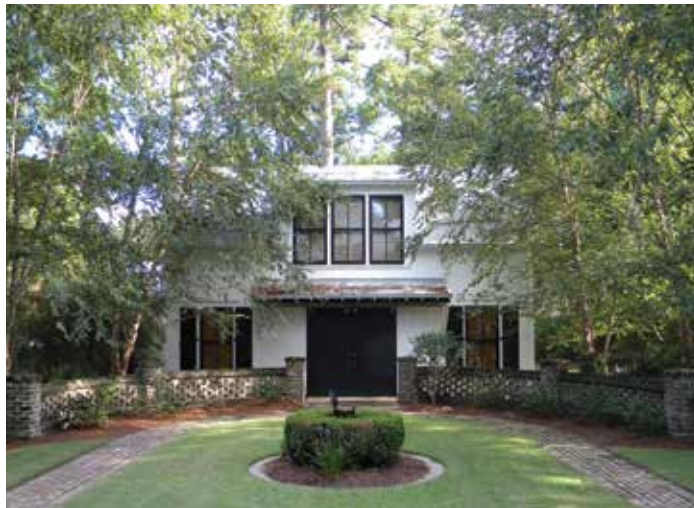
Outdoor living space is created between the main house and an outbuilding/garage.