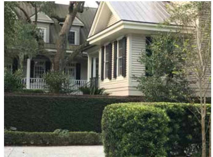
This effective use of a wall and hedges discreetly shields guest parking from public view, provides a private outdoor living space, and successfully minimizes the elevation of the home.